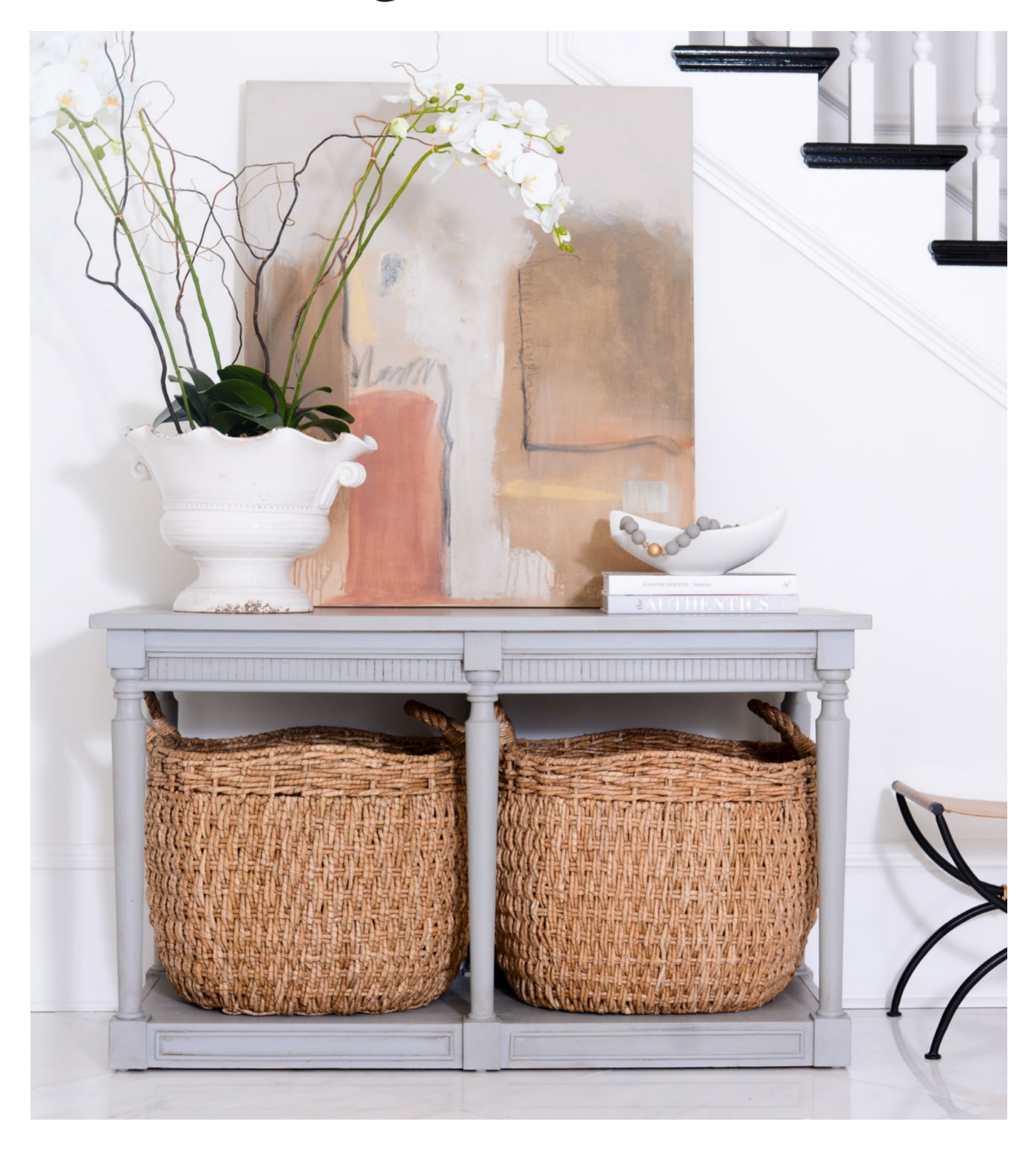
It's your life. Make it beautiful!